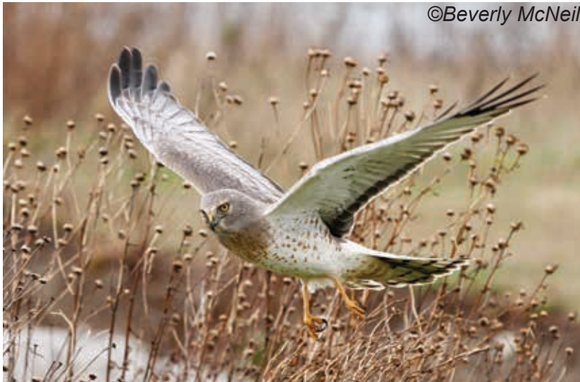
Northern Harrier, Fort Flagler, November 2020.