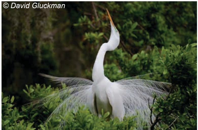
Great Egret, near North Beach.