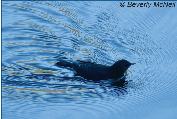
Mythical American Dipper, Quinault, December 2023

Admiralty Audubon Society of East Jefferson County PO Box 666 Port Townsend WA 98368