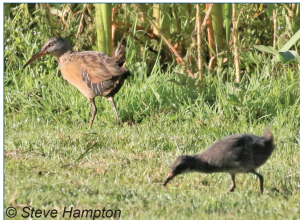
Two of the more than 130 species reported at Hastings Pond. Top: one of only a handful of reports in our region for Redhead Duck, Hastings Pond, March 2023; bottom: Virginia Rail and youngster, Hastings Pond, June 2021.

"We acknowledge that any option will include some human recreation footprint that is not natural habitat, such as sports and recreation facilities. Because wildlife benefits especially from contiguous parcels, it would be best if the natural areas and recreational facilities were clumped and not intermixed. Ten contiguous acres in a clump provides more habitat value than ten scattered or strung-out acres."