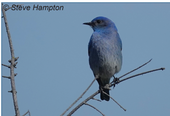
Mountain Bluebirds at Point Wilson, April 2023.