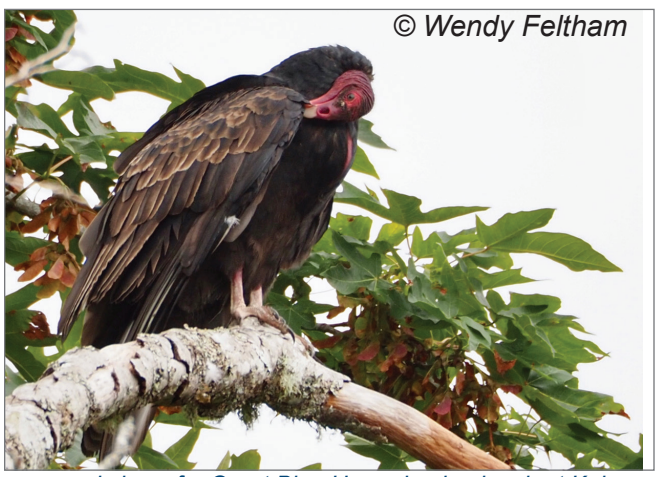
Some less conventional perspectives of feathered beauty: left - an unusual view of a Great Blue Heron having lunch at Kah Tai, 2021; right: One of 17 Turkey Vultures watching the salmon migrating up the Big Quilcene River in September 2021.