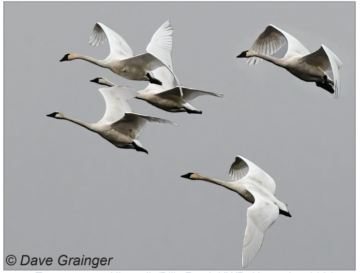
Trumpeters at Nisqually/Billy Frank NWR, November 2021.