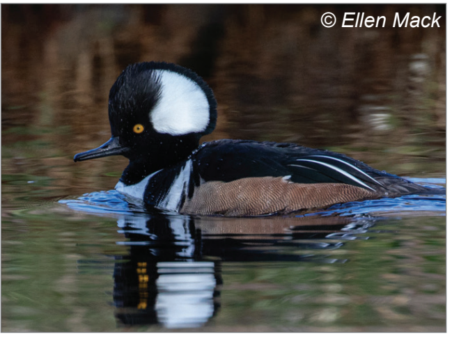
Photos clockwise from top left: Blue Jay in Uptown Port Townsend, November 2021; Scrub-Jay in Uptown, May 2021; Hooded Merganser male, Kah Tai, 2021; Hooded Merganser female, Point Hudson, Christmas Bird Count, December 2021.