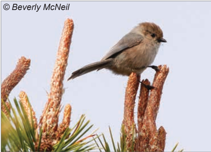
Bushtit, Point Wilson, April 2019